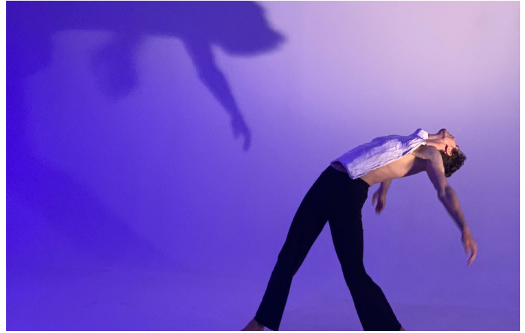
AND THERE IT WAS