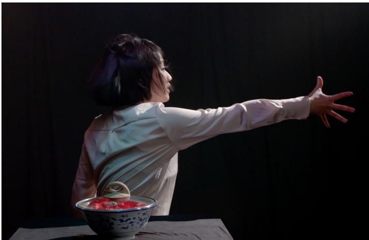
LOST IN TRANSLATION