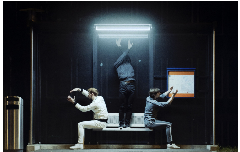
THE NOW AFTER