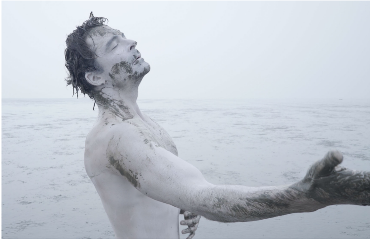
LIGHT - BEARER